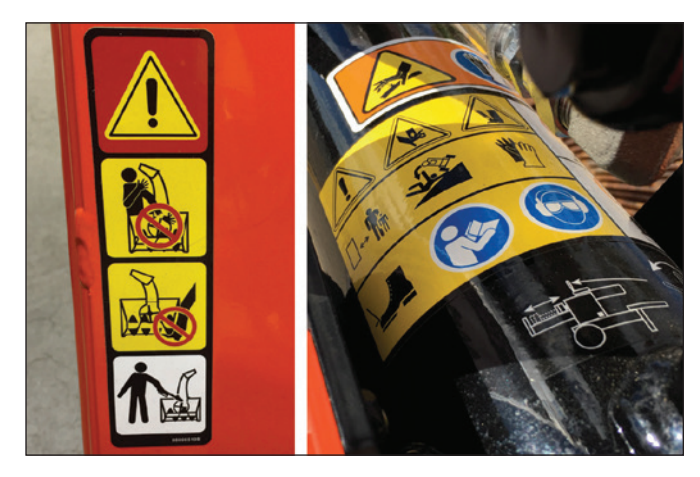
Figure 2: Examples of graphic-only labels

from a legal standpoint than warnings that continue to rely primarily on text when those same text messages could have been communicated by one or more symbols.